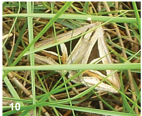
Fig. 10. Triangled Noctuid, Trigonodes hyppasia